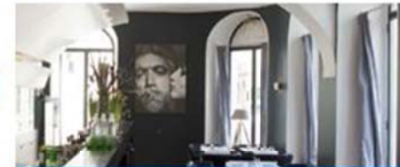
LUNCH: Restaurant Ellas Judenplatz 9