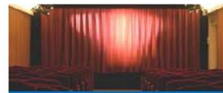
CABARET: Basement, Café Landtmann Universitätsring 4