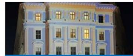
BANQUET: Bel Etage, Café Landtmann Oppolzgasse 6