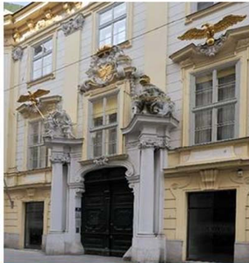
CONFERENCE: Old Town Hall Vienna Wipplinger Straße 6-8