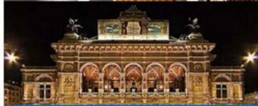
Sigmund Freud House, Schoenbrunn Palace, Vienna Opera House